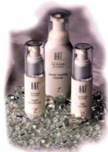
ART Skin Care System Rejuvenate Your Skin

Below are some of my family's favorite products that we use every morning. These are great ideas for your first Autoship order .